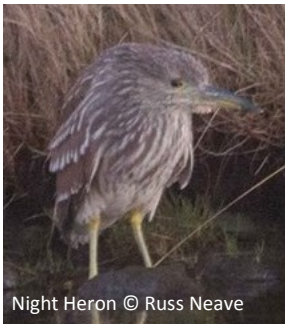
Night Heron