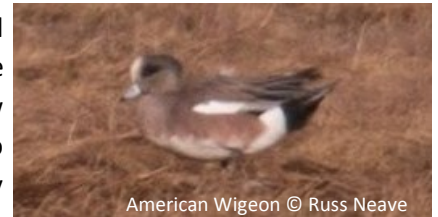
American Wigeon

Our regular wintering drake American Wigeon has found it's way back to North End this winter and has been seen several times on both North Loch and Loch of Rummie amongst a large flock of Eurasian Wigeon. We have also recorded a drake Smew which is a rare bird for Orkney, although recently it has switched allegiance to North Ronaldsay. I'm hoping it comes back so I can record it on the 2017 Sanday Bird list!